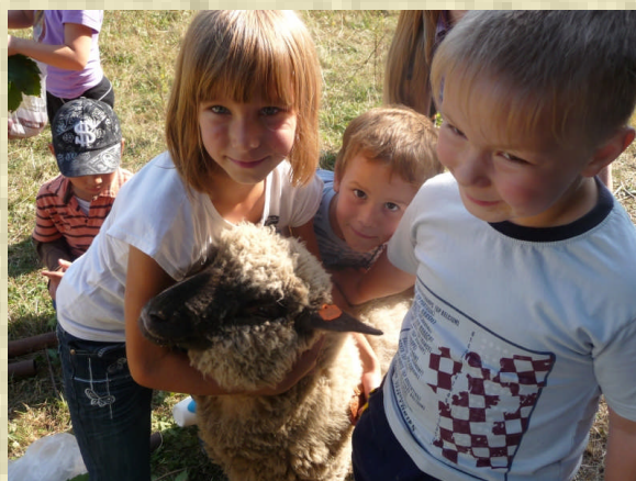
With school sheep