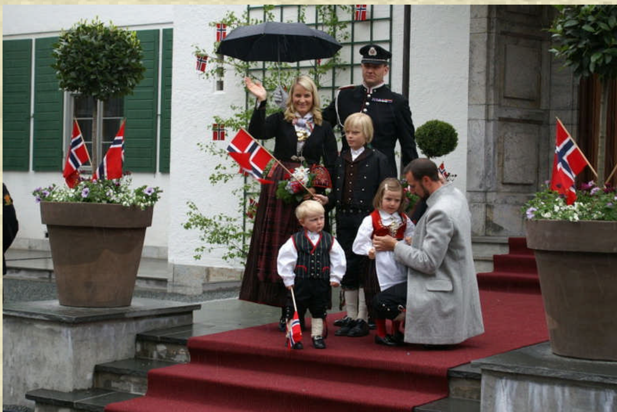
With crown prince and his family in Norway (Project Comenius)