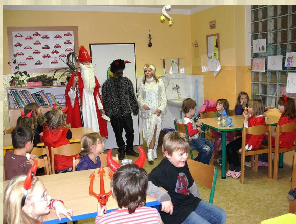
Czech lore (5 th December)