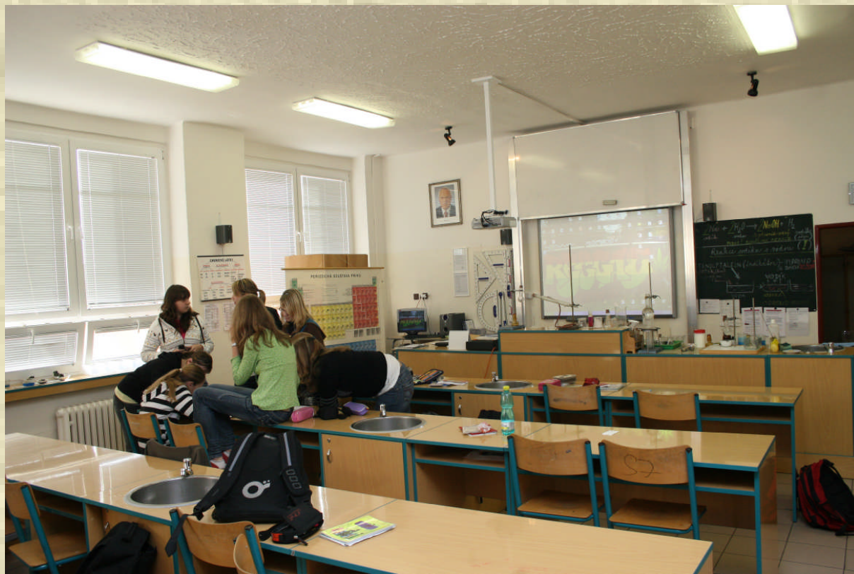
Laboratory of chemistry