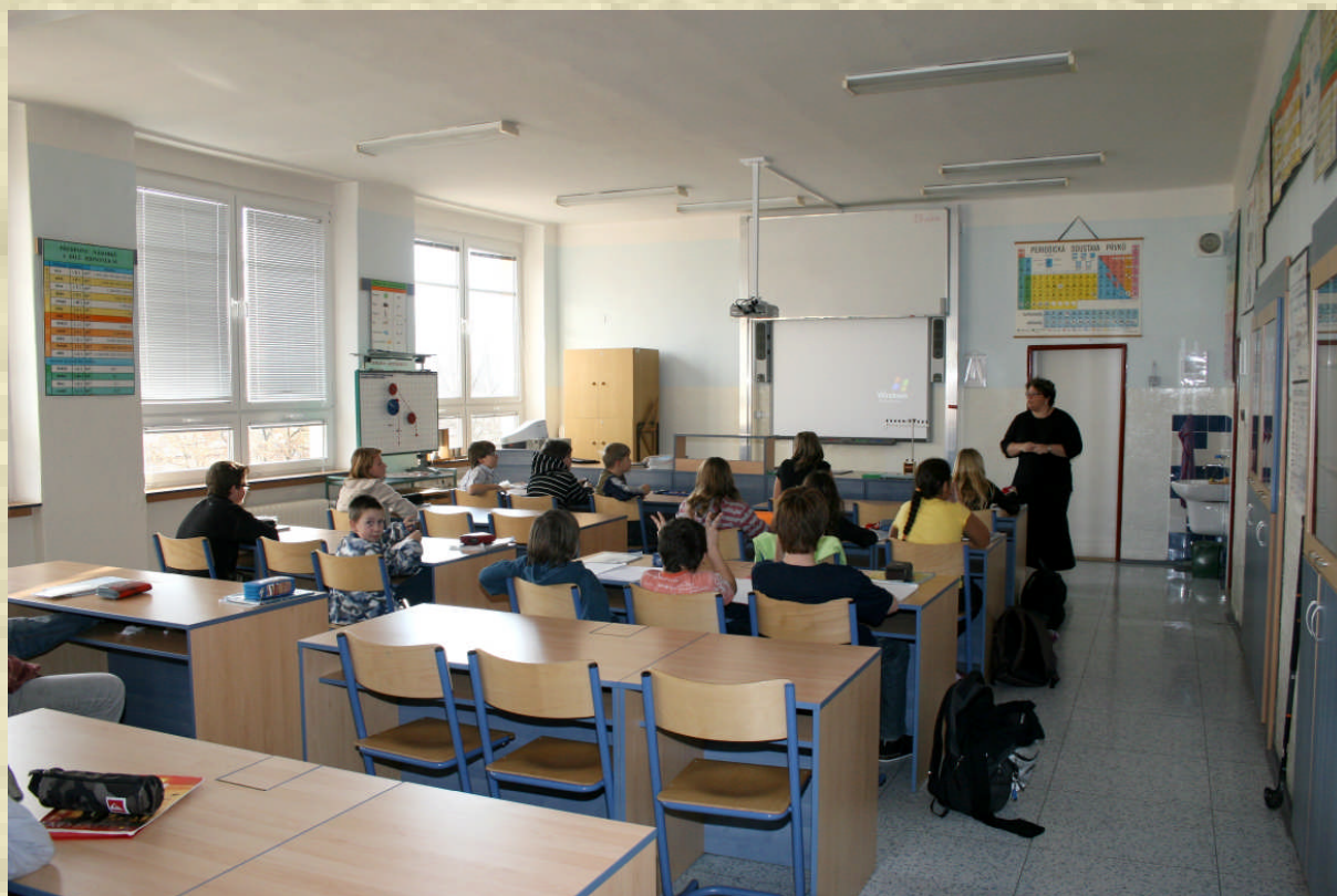
Laboratory of physics